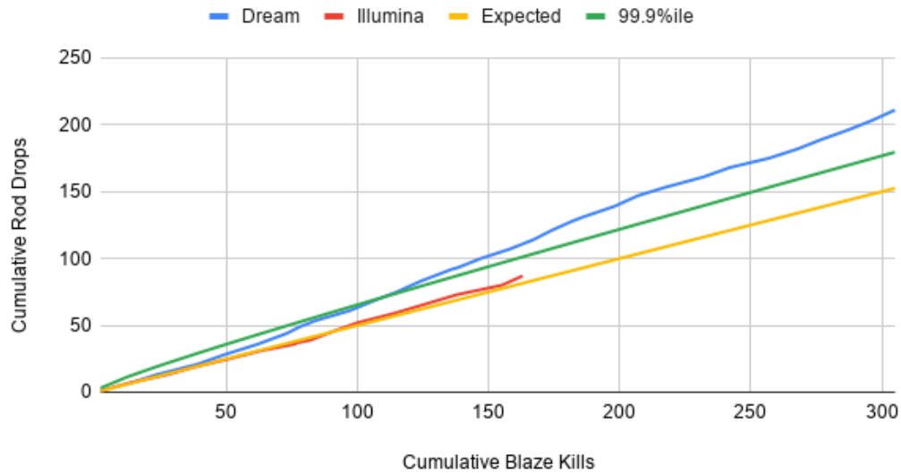
Figure 2: The same for blaze rod drops.